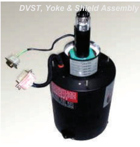
DVST, Yoke & Shield Assembly