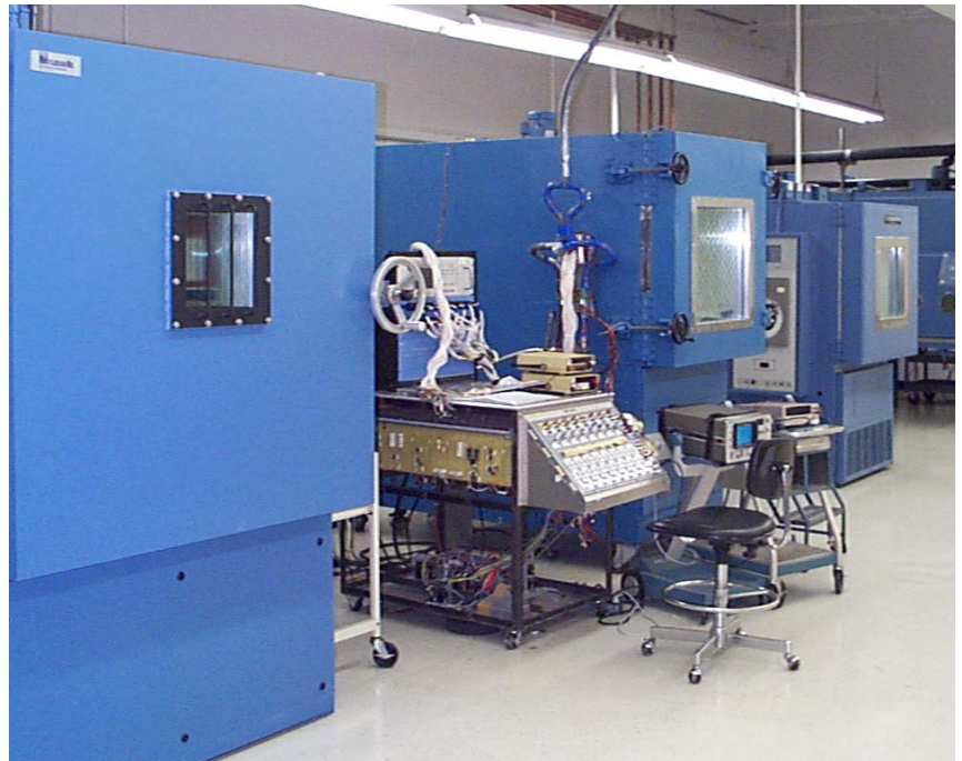
In-House Environmental Test Facility

Click here to submit an RFQ or to request more information.