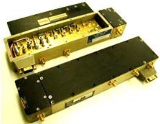
Limiter and Discriminator